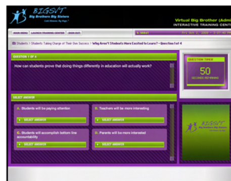
MULTIPLE CHOICE TESTING